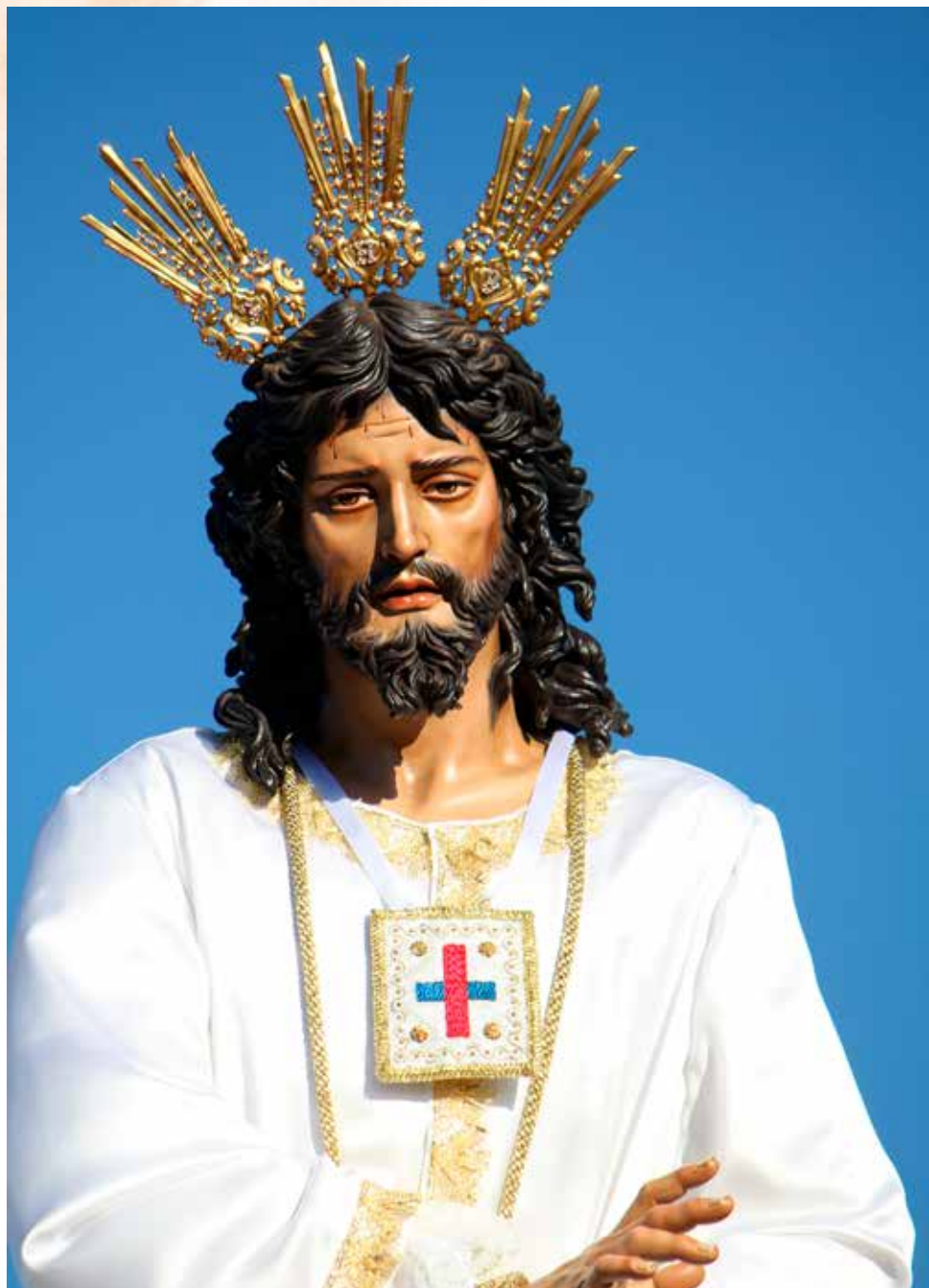
Captive Jesus of Sierra Morena