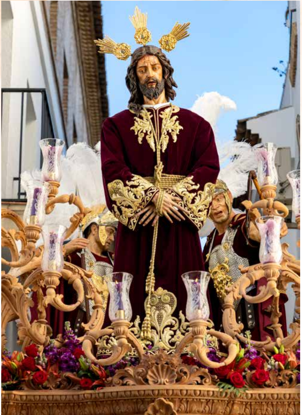
Our Father Jesus of the Sentence