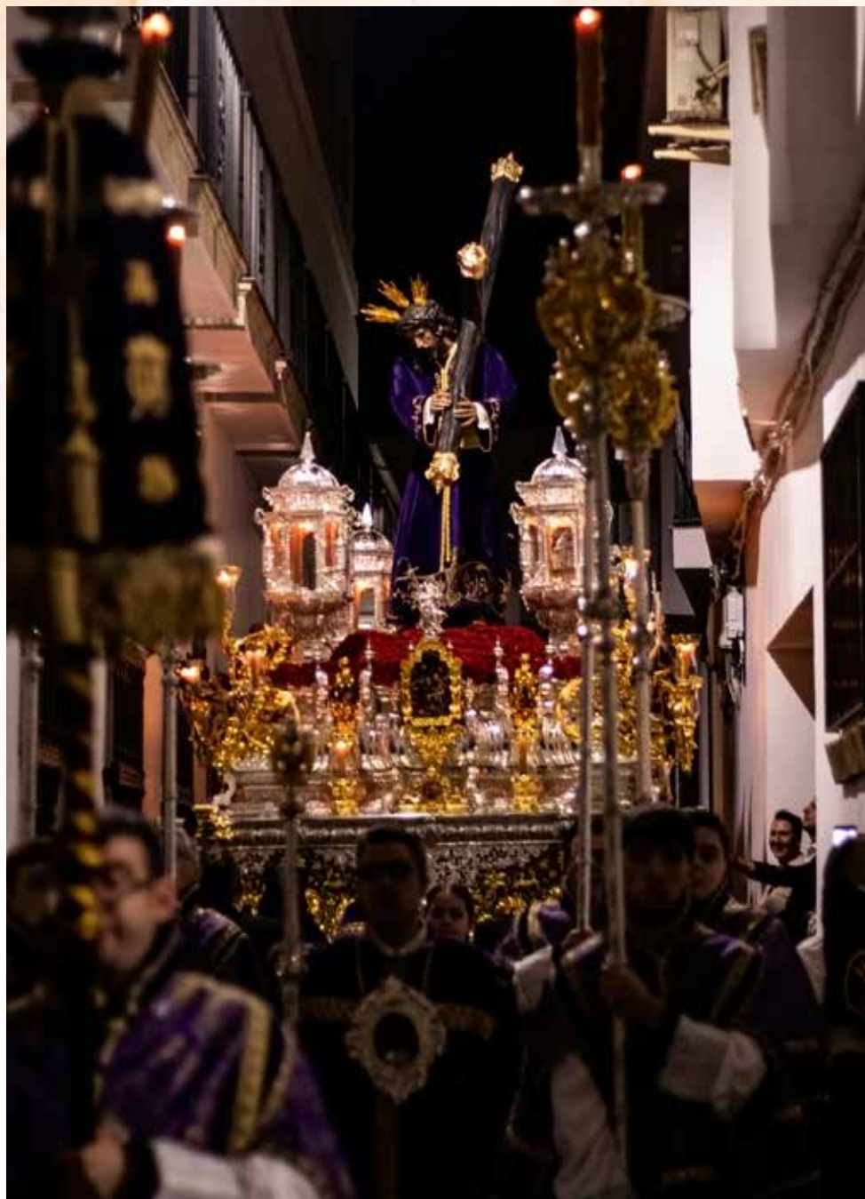
The Lord of Great Power as he passes through Carmen Street.