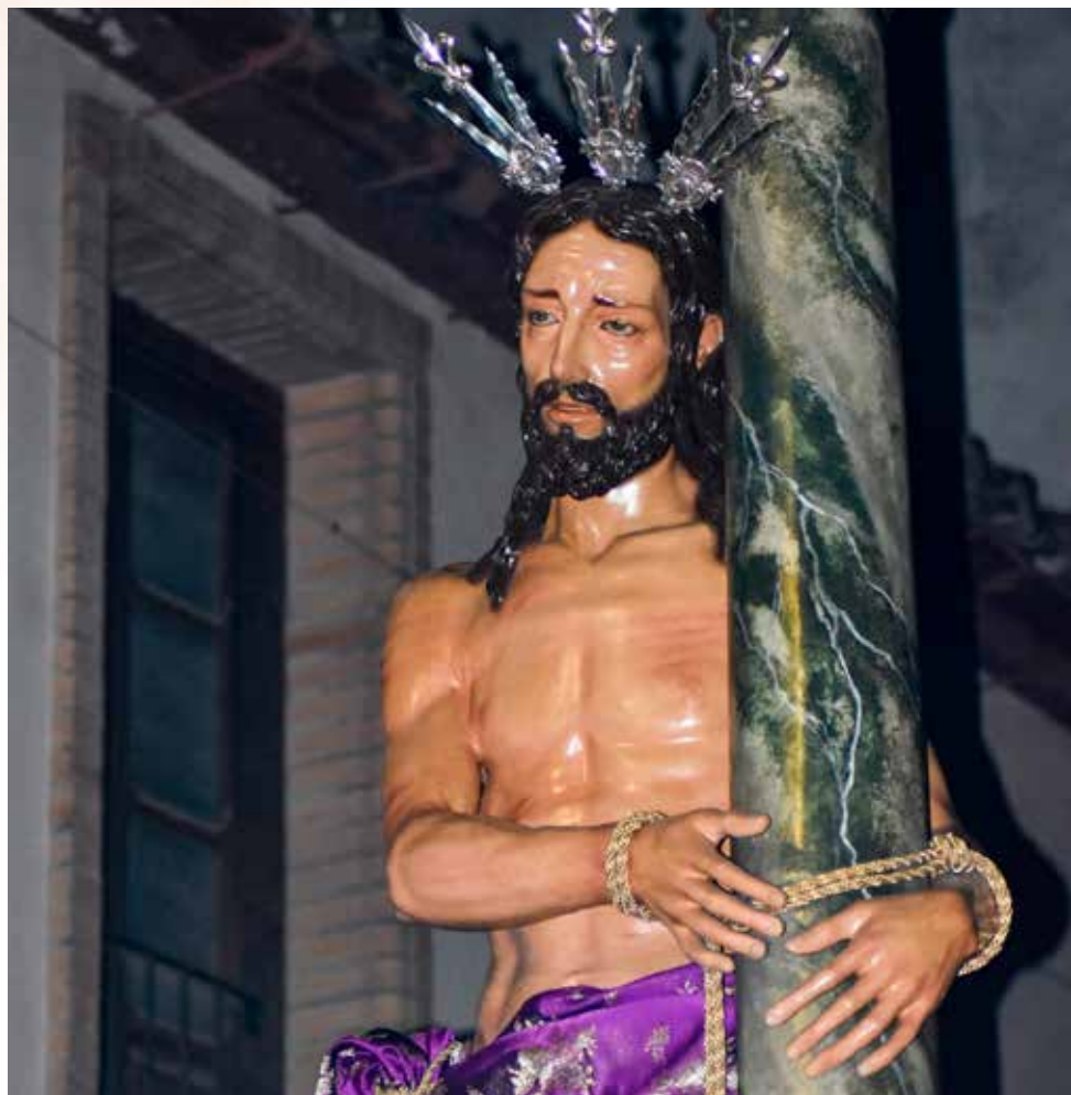
Our. Father Jesus tied to the column