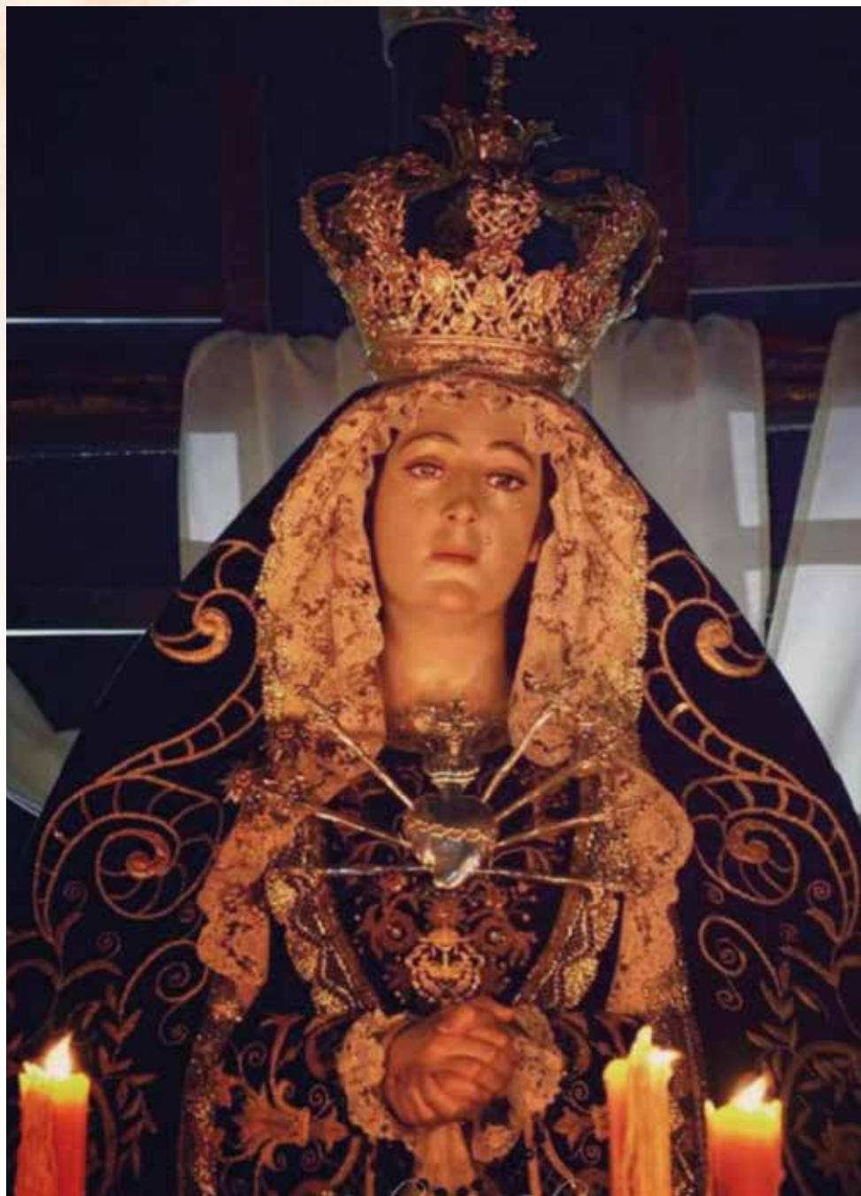
Our Lady of Victory in her Solitude