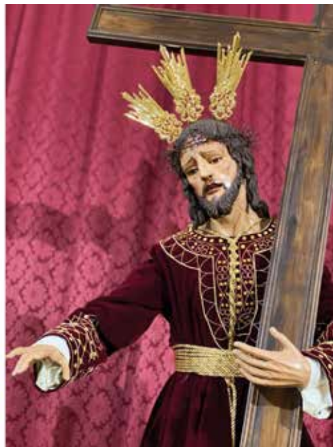
Our. Father Jesus of Health