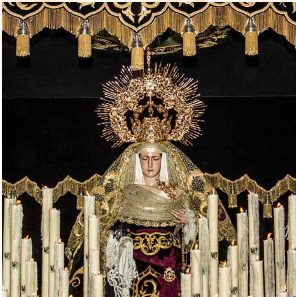
Our Lady of Sorrows

MUSIC: Musical Group Nuestro Padre Jesús de la Piedad in its Presentation to the Pueblo “La Estrella” of Jaén, after the Paso de Misterio, and the “Maestro Amador” of Andújar (Jaén), after the Palio.