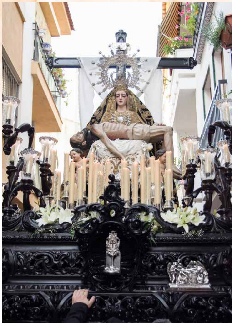
Our Lady of Sorrows