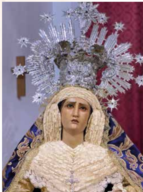
Our Lady of Sorrows