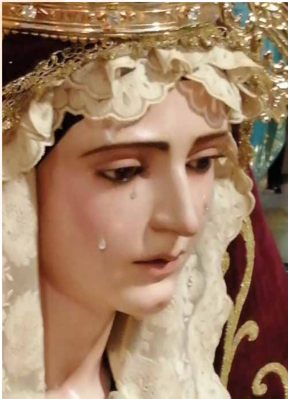
Our Lady of Bitterness