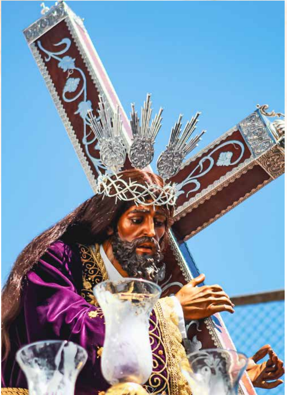
Our Father Jesus Nazarene "Lord of Lords"