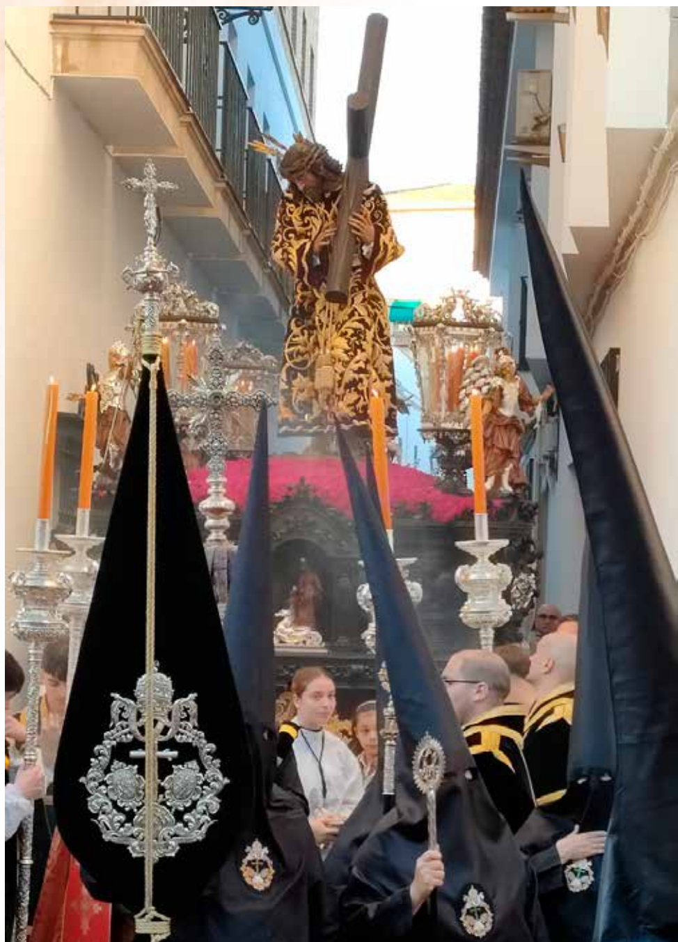
Our Father Jesus Nazarene