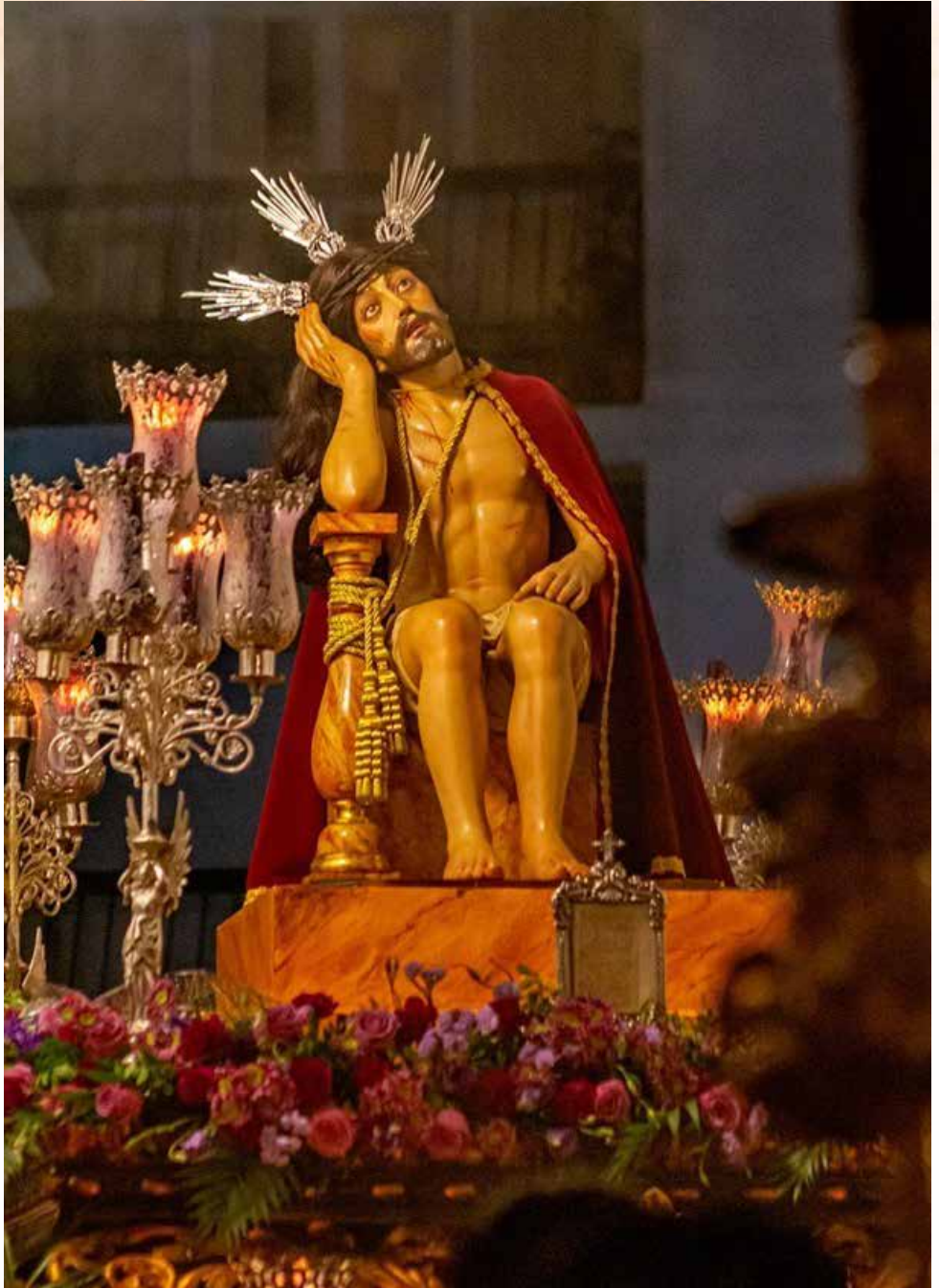
Our Father Jesus of Patience