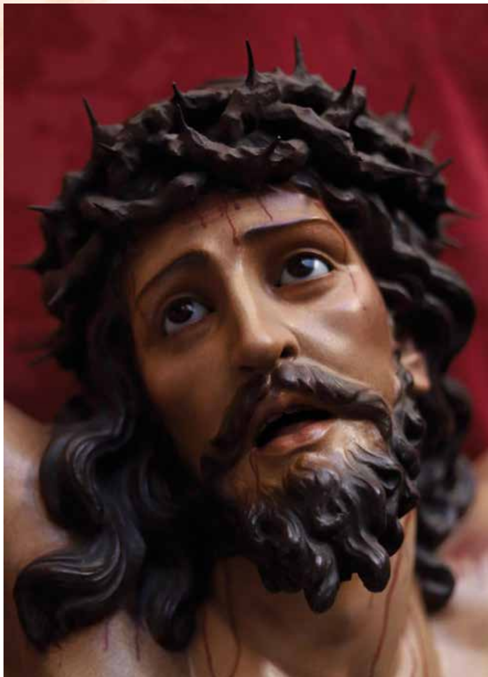
Christ of the Expiration