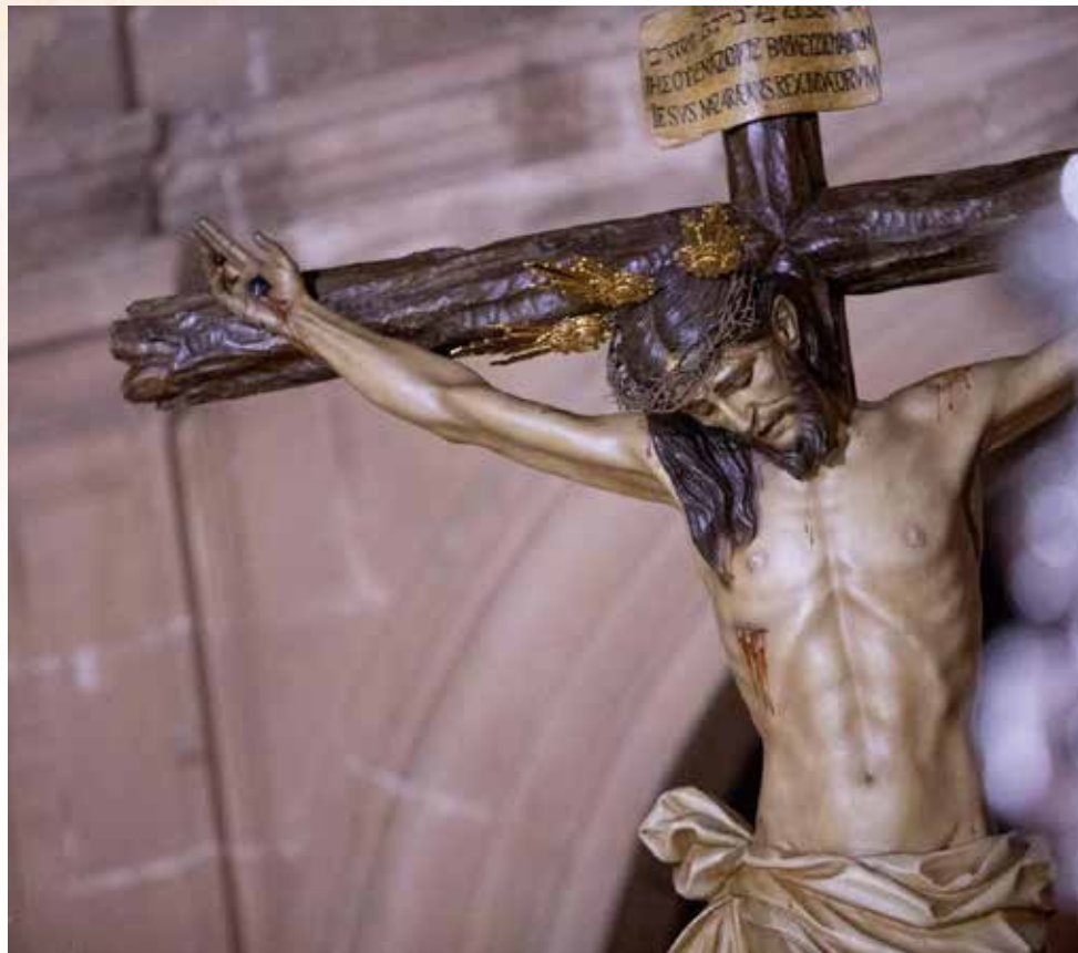
Holy Christ of Providence

INFORMATION OF INTEREST: It is recommended to contemplate the transit of the processional procession through some of the most beautiful corners of our city, some of them unique in the usual route of our brotherhoods of passion, such as its passage through the Old Church of Santiago or through Altozano Archbishop José Manuel Estepa. And, of course, its course along Alhóndiga Street, where a station is held in front of the niche that testifies to the devotion that the Holy Christ of Providence has awakened for centuries among the people of Andújar.