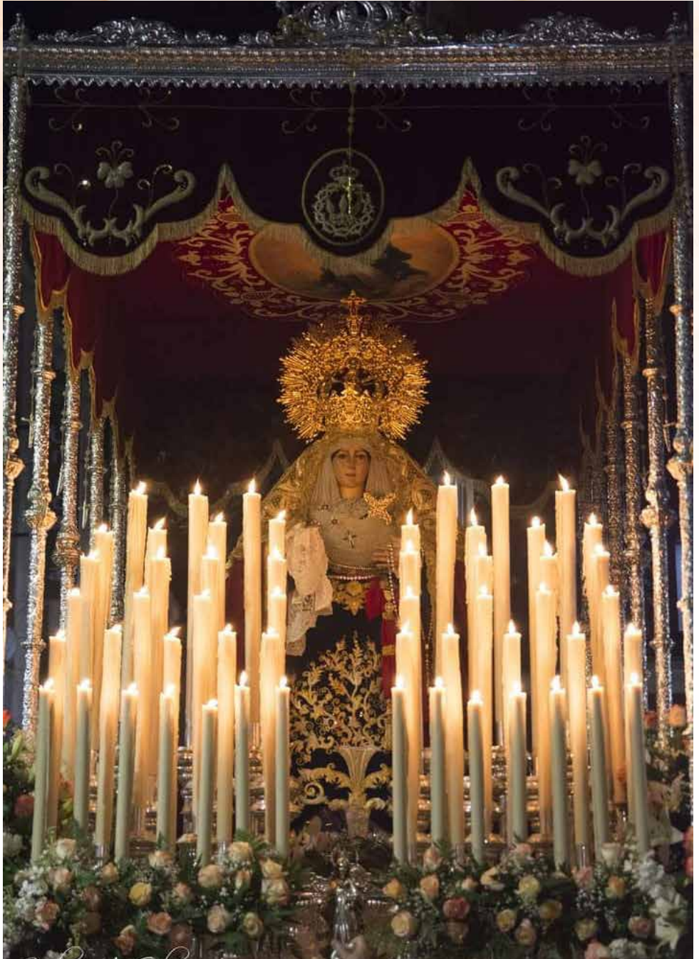
Our Lady of the Rosary