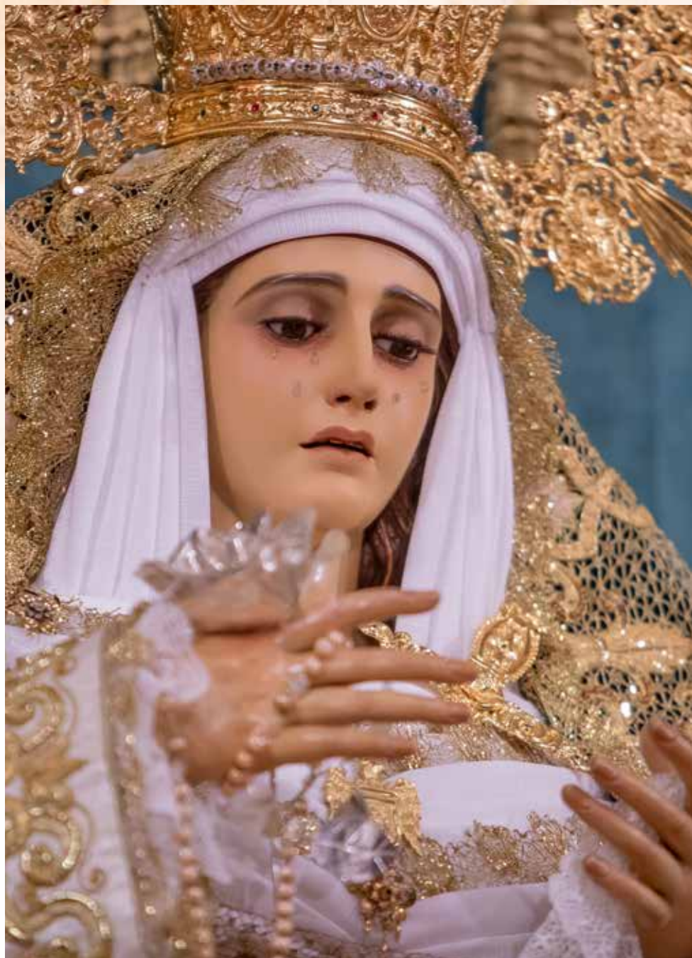
Our Lady of Hope