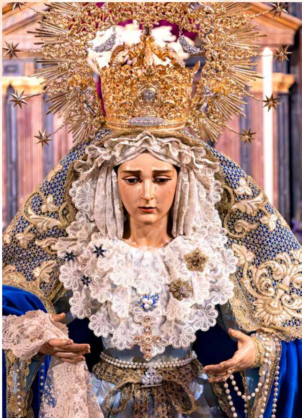
Most Holy Mary of Good Remedy