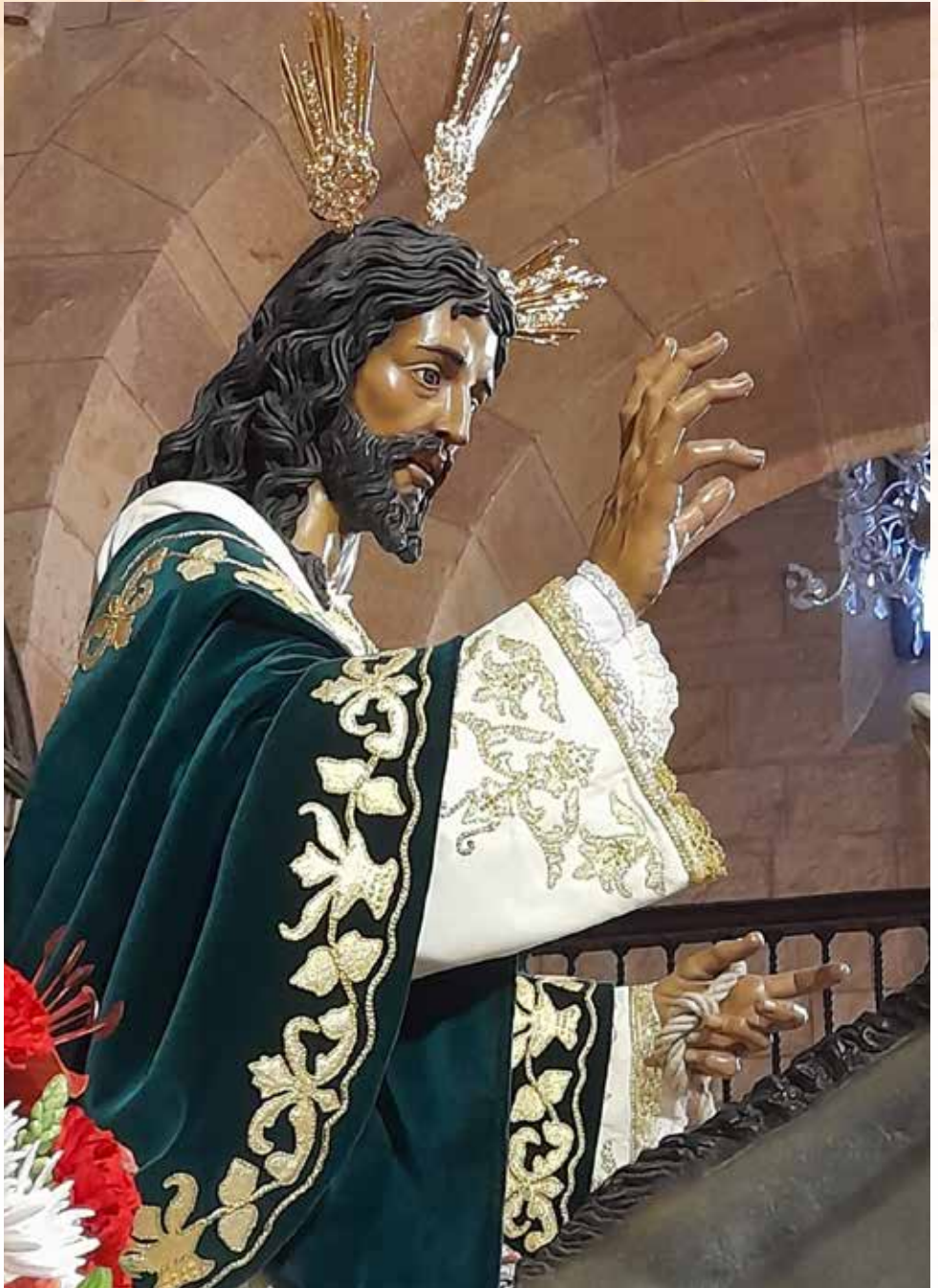
Our Lord of La Paz in his triumphal entry into Jerusalem